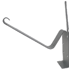
SquareMax Gutter GP Bracket