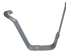
SquareMax Gutter Over Strap