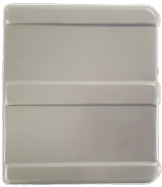
Gutter Stop Ends available in full range of colours to match your gutter